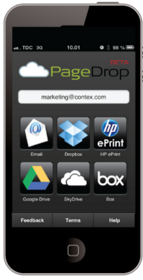
Scan the QR code

PageDrop includes a new pending patent that ensures a secure method for QR codes and Web Interfaces. PageDrop will only allow you to scan if you are in front of the scanner.