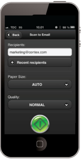
Press the green button