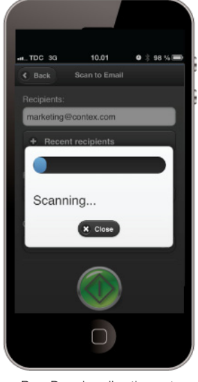
PageDrop handles the rest